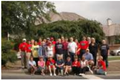
Vinings Rotary Club Rotarians at work.