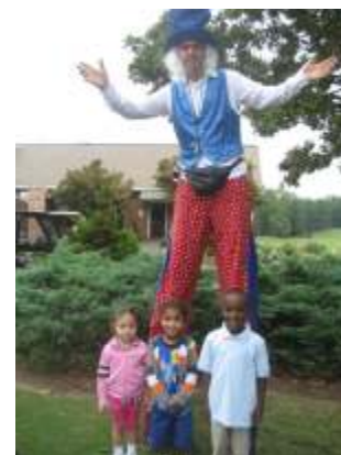
Uncle Sam with some of the children