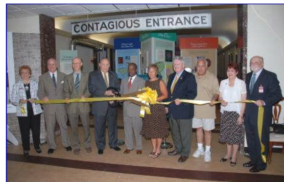
Ribbon Cutting Ceremony opened the Smithsonian "What Ever Happened to Polio" exhibit

The Roosevelt Warm Springs Institute hopes to complete the center well before the 2017 Rotary International Convention, scheduled to be held in Atlanta, Georgia, in hopes to attract Rotary members from across the globe to Warm Springs to celebrate the work both the Institute and Rotary have contributed to the fight against polio. If you are interested in making a donation to help reach the $250,000 goal, please contact the RWSDP Planned Giving Department at (706) 655-5666.