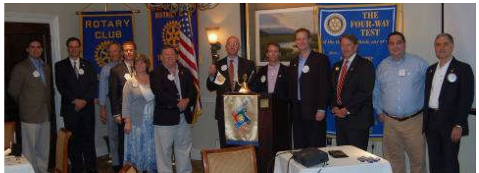
The newly elected East Cobb Board Members will continue where the previous Board left off. Other scheduled programs include mentoring for Brumby Elementary, AIDS Awareness for Wheeler and Walton High Schools, and the Georgia Rotary Student Program.