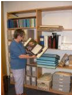
Bainbridge Club History Room Librarian