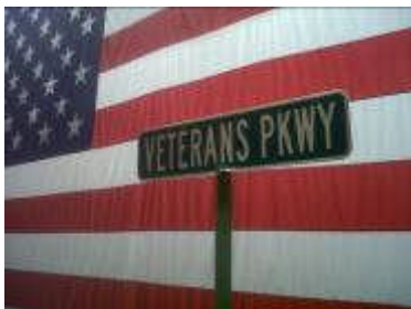
On June 12, the City of Barnesville officially dedicated a section of Highway 341 that comes through our town as VETERANS PARKWAY. The flag that you see was draped on the stage and measures 38' long x 20' tall - it created quite a patriotic spirit as we lowered it into place and marched out the 83 WWII Veterans.