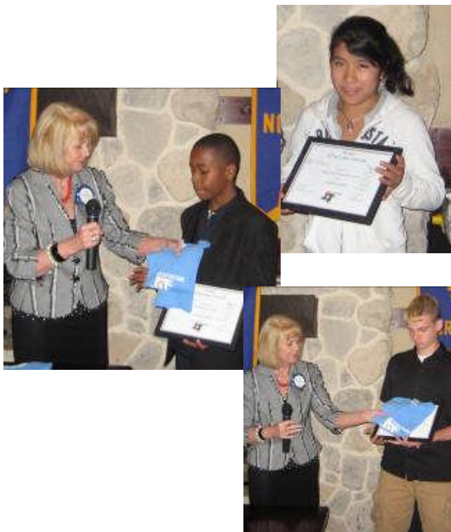
Photo Story Rotary Club of North Fulton Salutes Student Character